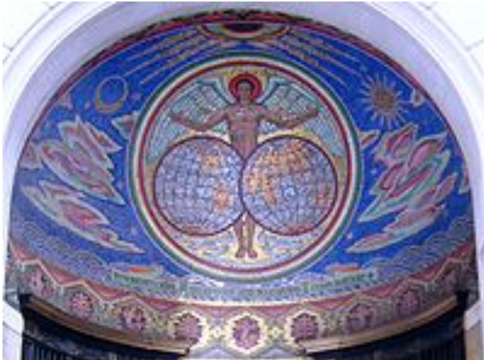
Sic Transit Gloria Mundi

ITT's building in New York featured a magnificent world-encompassing mosaic: