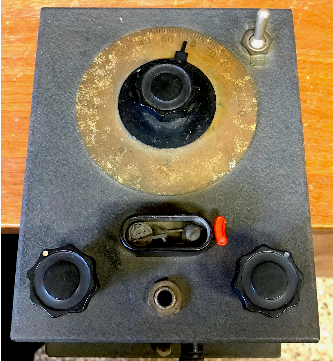
The MacKay 123-B, as Found

The big dial is antenna tuning. The left knob selects an antenna coil. The right knob provides secondary tuning.