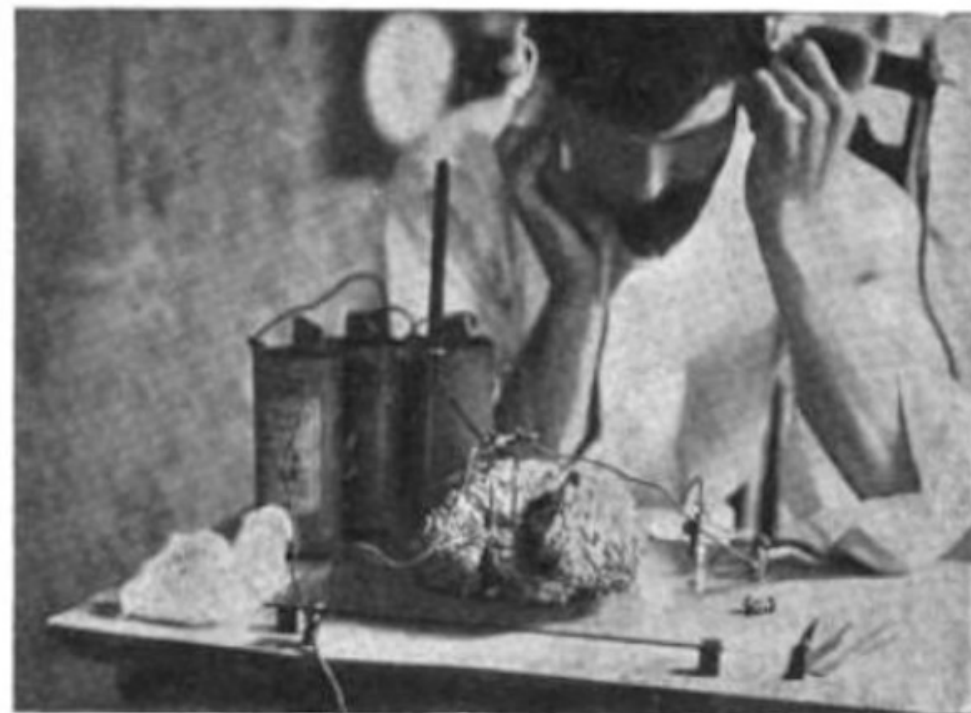
FIG. 7.—LISTENING TO COHESION OF HUMAN BRAIN UNDER ACTION OF ELECTRIC WAVES.