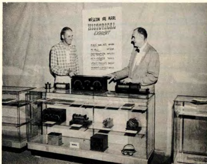
W6EA and W6AM (right) today. We had many phone QSOs in 1912.

By the way, the 6OC antenna was 3 blocks long, over 3 sets of 2200 volt power lines.