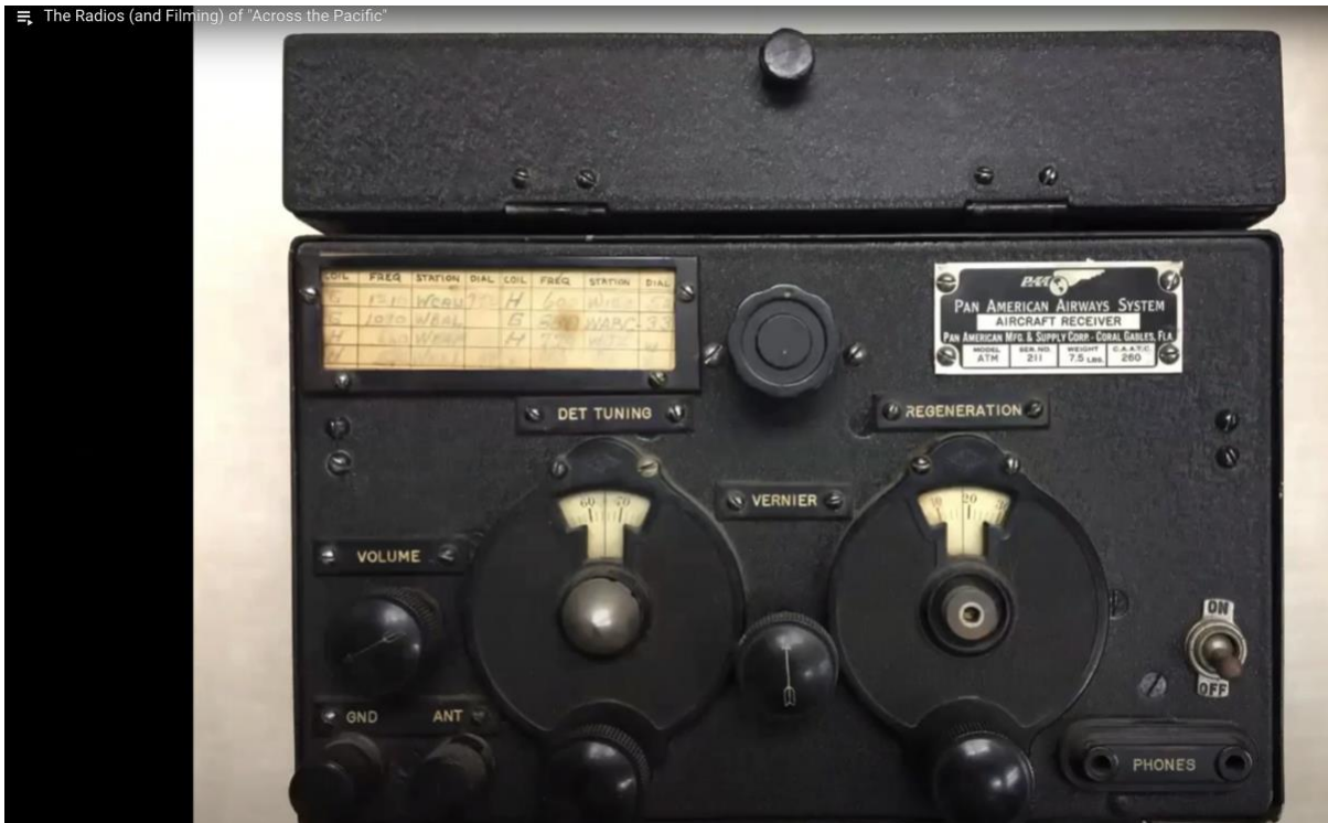
Pan Am aircraft model ATM receiver 1930s with coil box; AWA screenshot