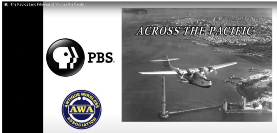
Clipper over the San Francisco Bay; AWA screenshot

PBS has just done a video about Pan American Airways in the 1930s –'40 era with help from the Antique Wireless Association.