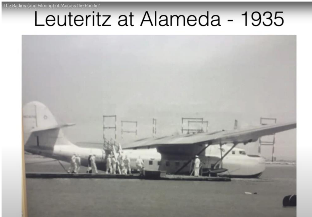
Clipper with Alameda Adcock Antennas; AWA screenshot

The Adcock 1 arrays were very big antennas for HF (high frequencies, the primary wavelengths for aircraft at the time). In Alameda they would have stood at least as tall as the iconic shipping cranes do now. A still (above) from the AWA video shows the antennas and a Clipper.