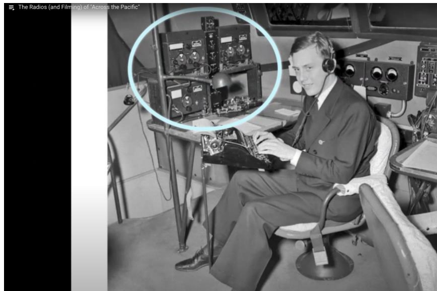
A Pan Am radio Officer on Deck, 1930s

AWA members contributed most of the period equipment in the video. According to the video, Pan Am bought and frequently modified commercial gear, especially National Radio Company radios. Pan Am favored its SW-3, at least as a basis for development.