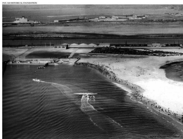
Arriving at Alameda

The PBS video Across the Pacific , done in association with the Pan Am Historical Foundation ( www.panam.org ), emphasizes radio, both communications and direction finding. Pan Am flew its flying boats out of Alameda, California, now famous as the home of the California Historical Radio Society.