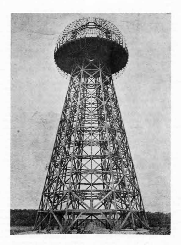
TESLA CENTRAL POWER PLANT AND TRANSMITTING TOWER FOR WORLD TELEGRAPHY LONG ISLAND, N.Y.